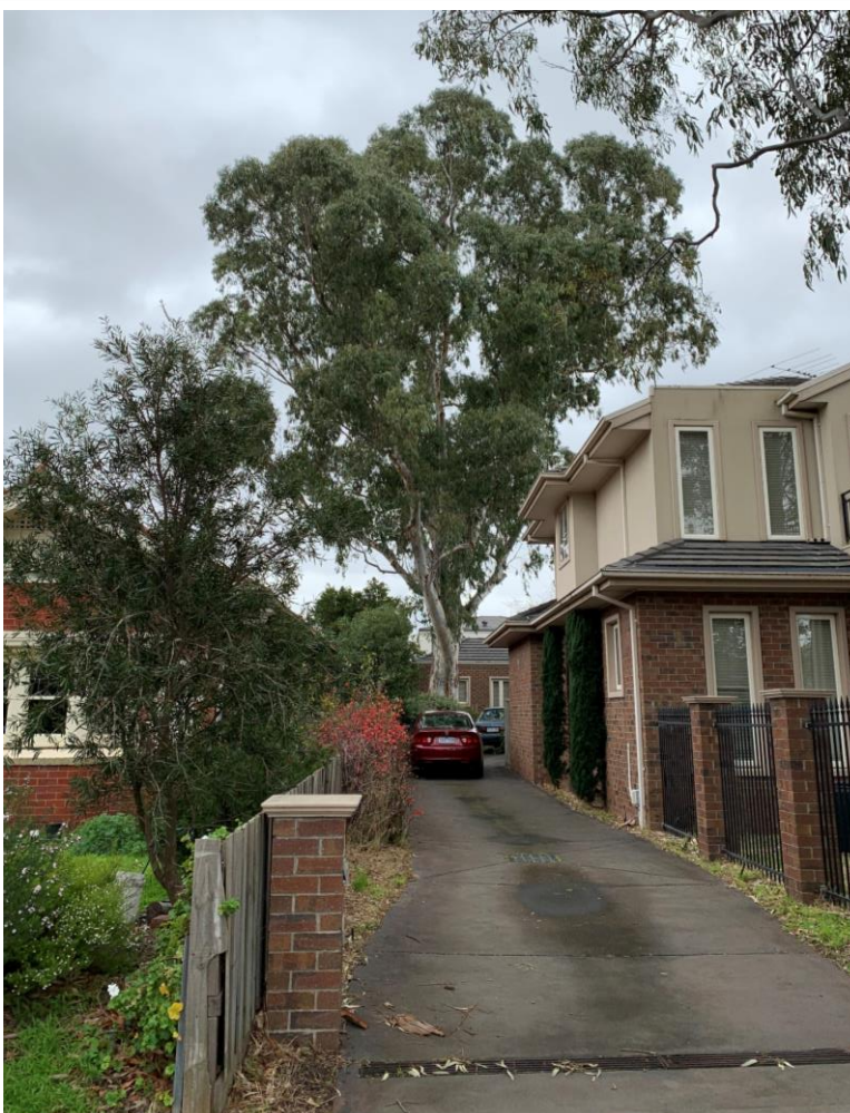
Tree 2 – River Red Gum ( Eucalyptus camaldulensis )

Due to its impressive size, age and health, this is an outstanding example of the species for the local area and beyond, whether on private land or in otherwise. This also ensures the tree has outstanding habitat and biodiversity value as it supports a range of native wildlife with foraging, roosting and habitat.