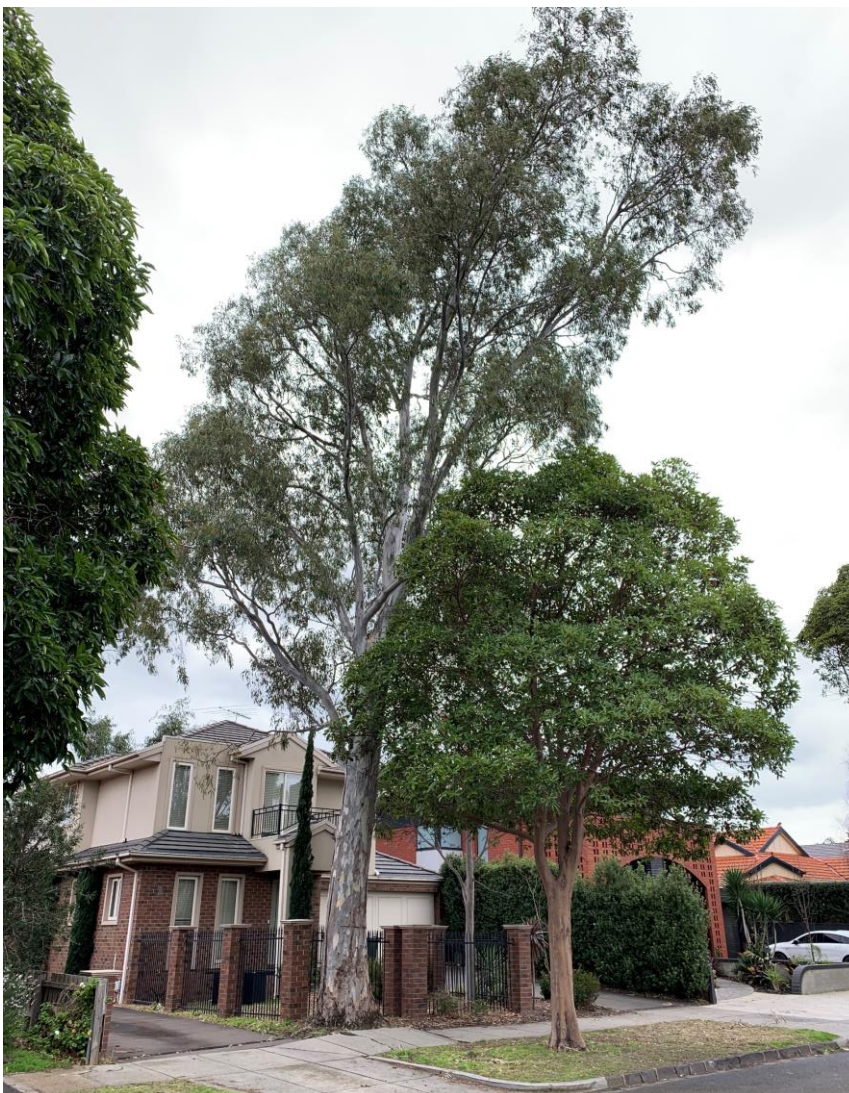
Tree 1 – River Red Gum ( Eucalyptus camaldulensis )

As a particularly tall, indigenous flowering tree in the local area, it is of outstanding value for native wildlife providing a valuable resource for foraging and roosting.