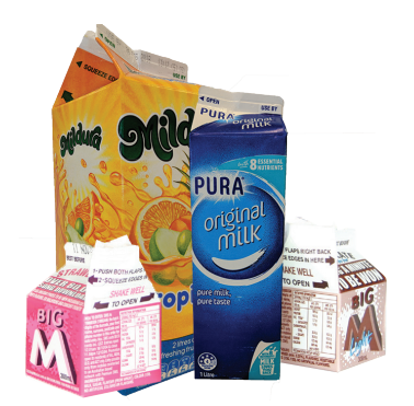
Cartons (not long-life)

Empty plastic bottles, containers and container lids (plastic bottle lids go in red bin)