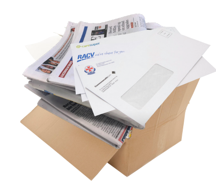
Cardboard, paper, newspaper and envelopes