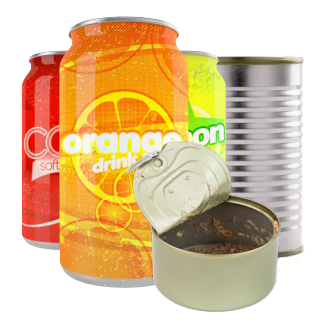
Aluminium and tin cans