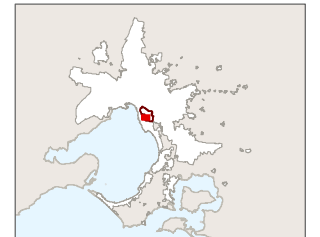
Part of Planning Scheme Map 3HO