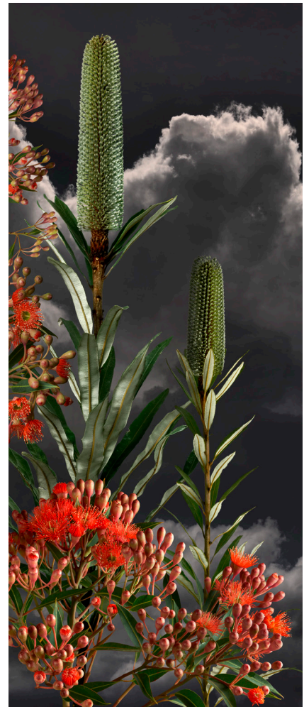
Valerie Sparks Red Flowering Gum 1. 2023 (detail) Sanctuary Series 3 Inkjet Print on Bauhaus New York SA Wallpaper 170 x 76cm

A series of programs including workshops and floor talks will be scheduled throughout July and August in association with the exhibition.