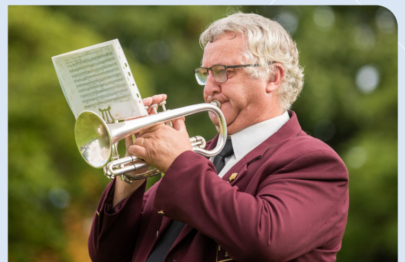
Glen Eira City Band