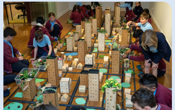
Sustainability activities at Glen Eira Gallery